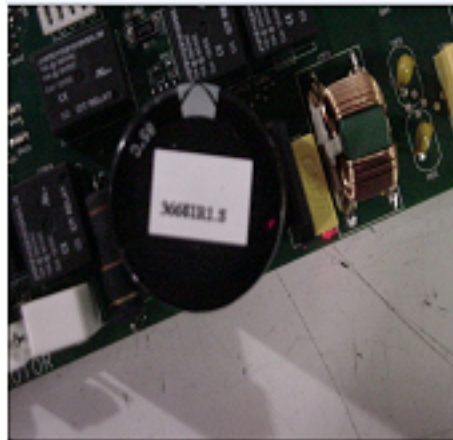
Label Shown on the Capacitor of the Board Itself