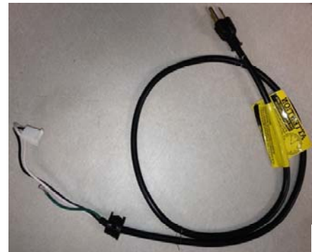
Power cord from unit with new board

In addition, new boards are backwards compatible to older units with power cords that have the Toroid Ferrite. Use of the older boards is not permitted without this piece as it would not be compliant with FCC/regulatory requirements.