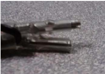
Connectors on End Coax Cable

To install the coax cable to the receiver, consult the instructions packaged with the coax cable (PN 108035.0001.S).